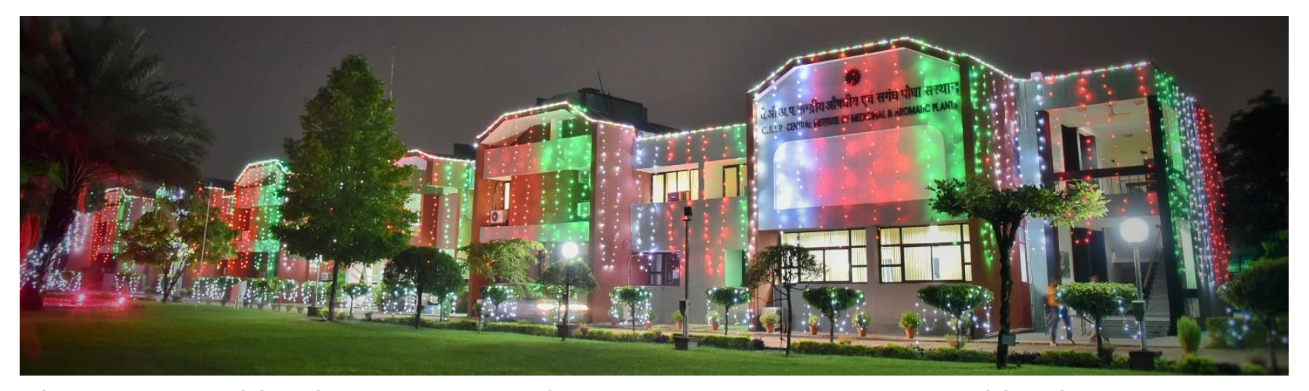
Organized by: CSIR-Central Institute of Medicinal and Aromatic Plants (CSIR-CIMAP), Lucknow

CSIR-Central Institute of Medicinal and Aromatic Plants (CSIR-CIMAP), a frontier plant research laboratory of the Council of Scientific and Industrial Research (CSIR), is steering multidisciplinary high-quality research in biological, agricultural and chemical sciences, and extending technologies and services to the farmers and entrepreneurs of medicinal and aromatic plants (MAPs). CSIR-CIMAP has made great progress in fundamental research, technology and product development, extension activities and human resource development and played a key role in positioning India as a global leader in production of mints, vetiver and other aromatic grasses, and in ensuring indigenous production of artemisinin - a WHO approved anti-malarial. CSIR-CIMAP has also played a key role in successfully commercializing an ayurvedic herbs-based anti-diabetic formulation, which has now benefitted millions.